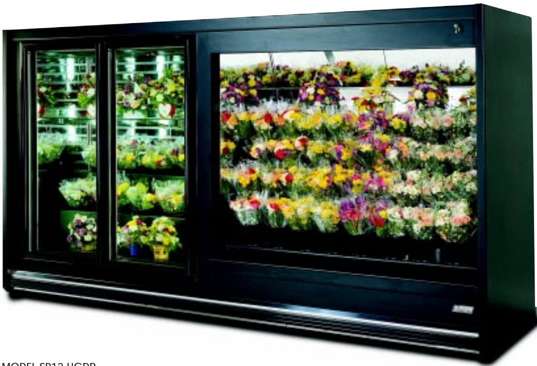
MODEL SP12 HGDR